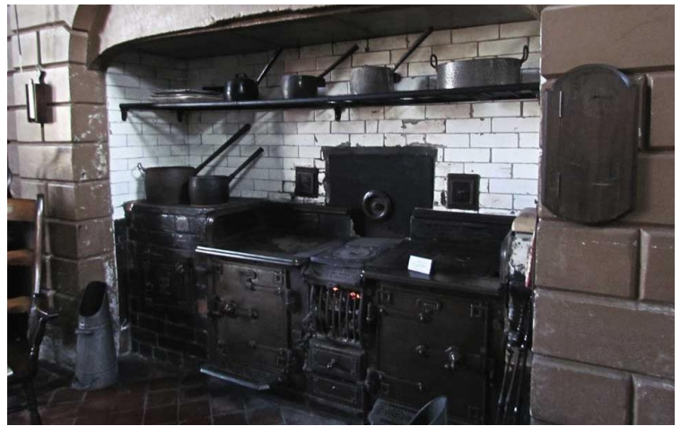
A coal fired kitchen range

under pressure was, initially, for two hours of the day only and had to be supplemented with water stored in cisterns. Some houses were able to top up their water supply from their private wells by using a manual pump. A constant supply of water under pressure was provided after 1853. In the intervening twenty years the population of the estate had grown considerably.