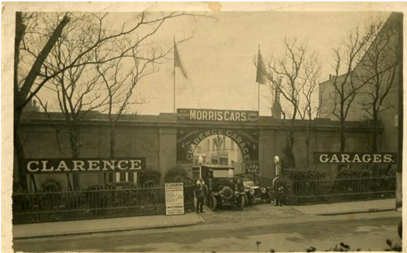
Clarence Mews, Eastern Road, opposite St. Mark's Church in the early motor age.

households arrived further mews were constructed around the perimeter of the Estate, for example, at Sussex Mews behind 1-10 Sussex Square and adjacent to it, Clarence Mews. Arundel Place was developed with individual stables and mews built for households on the estate. As motor cars replaced horse-drawn carriages after the First World War, coach houses became garages or put to a whole range of other uses.