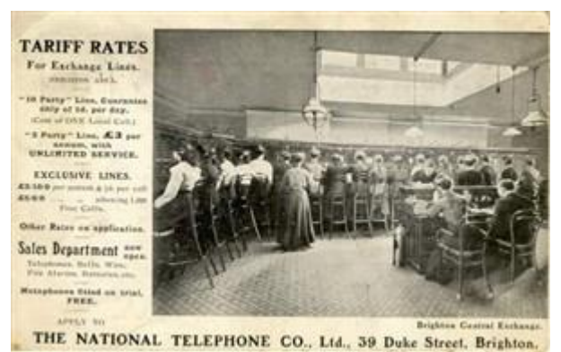
Promotional postcard for National Telephone Company,c 1907, showing the main exchange in Duke Street.

The first telephone exchange opened in Brighton in 1882 and by 1885 there were 138 subscribers. At that time local telephone networks allowed subscribers to speak only to other subscribers in their local network. The country's first trunk line was opened in 1884 between London and Brighton. It enabled Brighton subscribers to talk to any telephone subscriber in London, and Brighton subscribers were listed in the London directory. The Brighton network was acquired by the Post Office in 1906<sup>4</sup>.